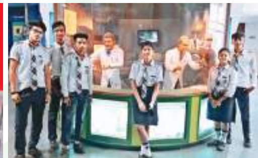
National Science Centre, New Delhi