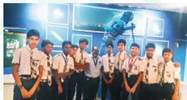
Nehru Planetarium, New Delhi