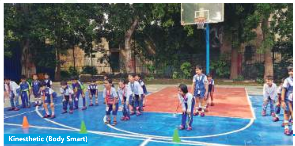
Kinesthetic (Body Smart)