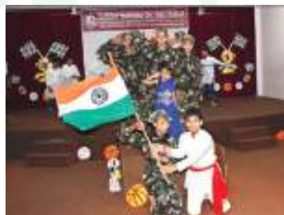
Workshop with LT. COL. SATYENDRA VERMA