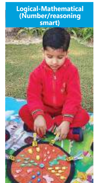
Logical-Mathematical (Number/reasoning smart)