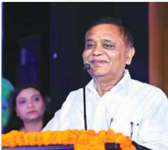
Chief Guest Hon'ble Atul Garg Ji, Minister UP Govt.