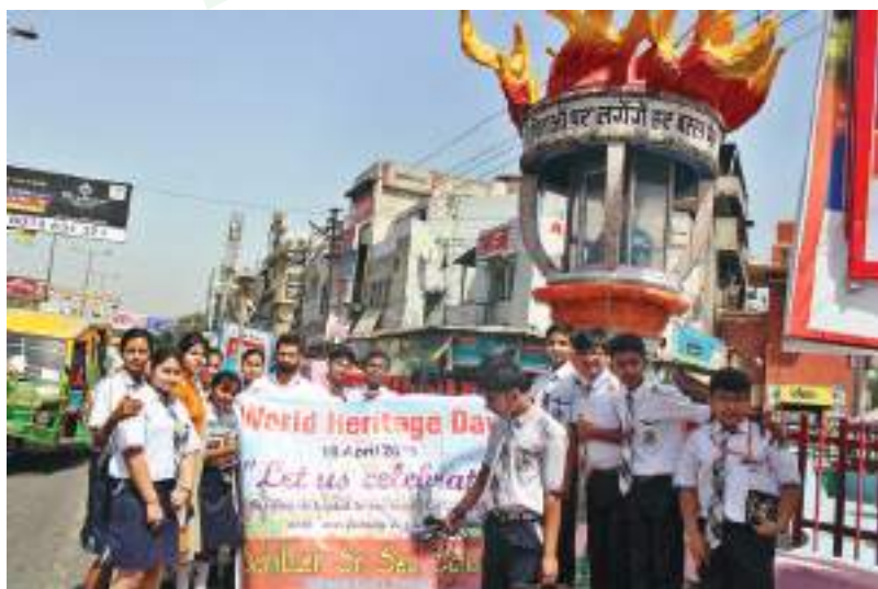
18-04-2018, World Heritage Day