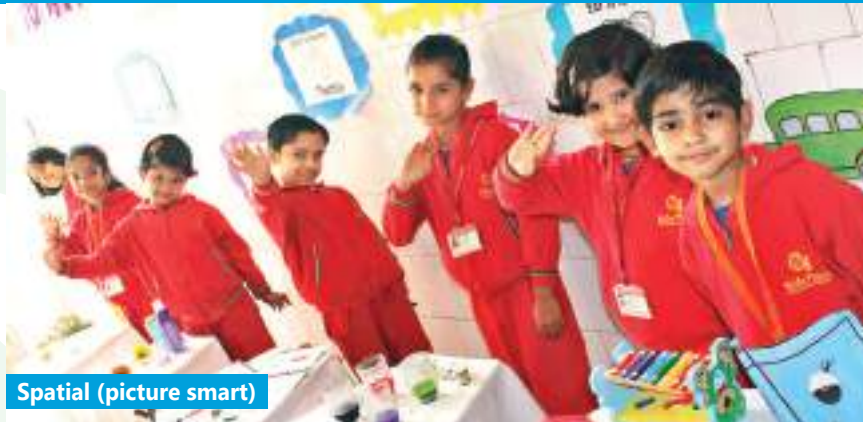
Spatial (picture smart)