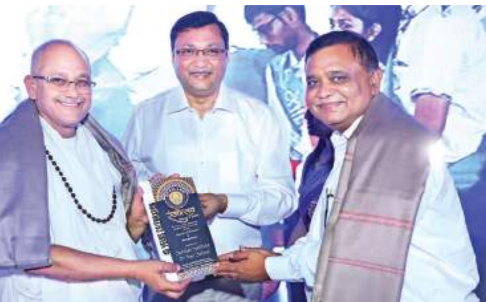
Our Hon'ble Chief Guest and Guest of Honour