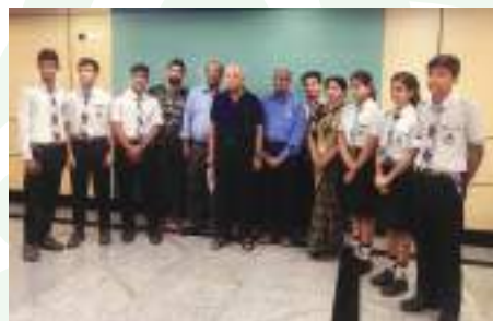
Workshop at AIIMS regarding "Gazing in to the Horizon of Immune System"