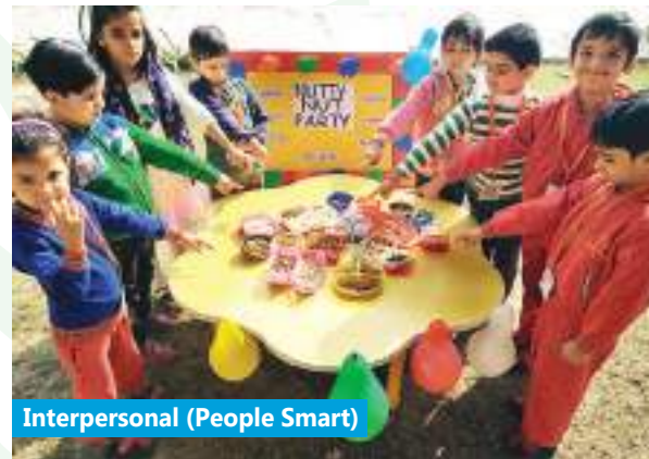
Interpersonal (People Smart)