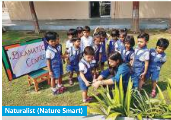
Naturalist (Nature Smart)