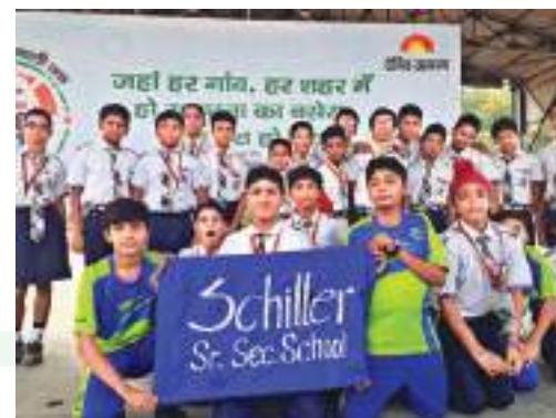
Cleanliness drive at India Gate New Delhi