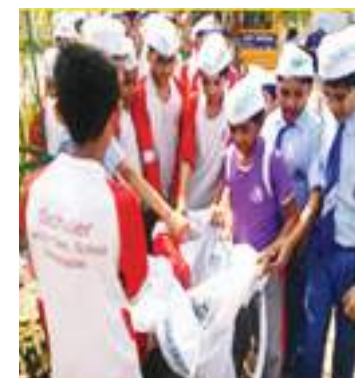
Cleanliness drive at Central Park Ghaziabad