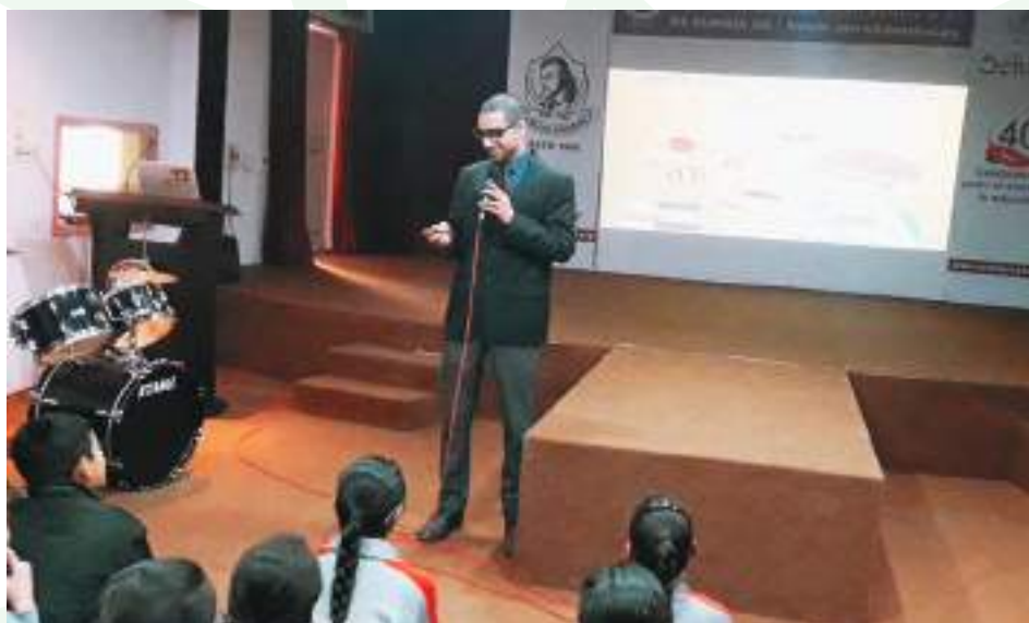
Life Skill Workshop - Art of Concentration In The Age Of Distraction