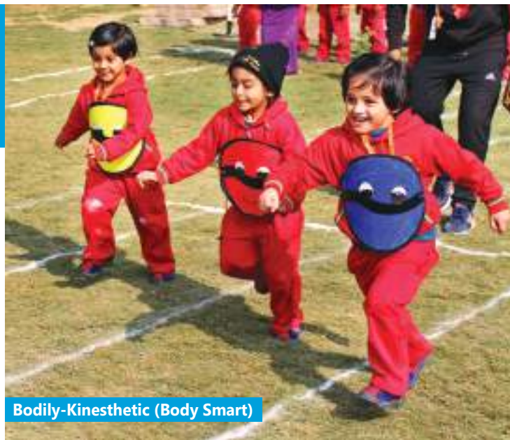
Bodily-Kinesthetic (Body Smart)