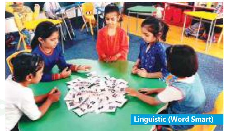
Linguistic (Word Smart)